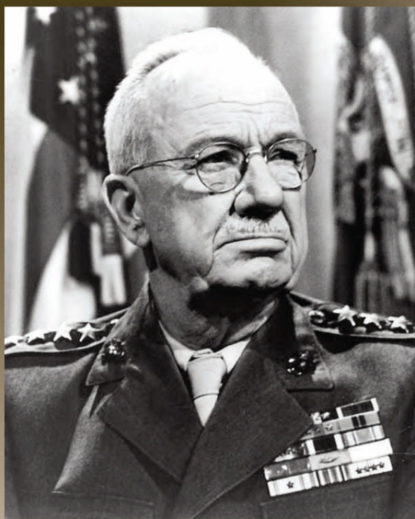
Gen Holland M. "Howlin' Mad" Smith