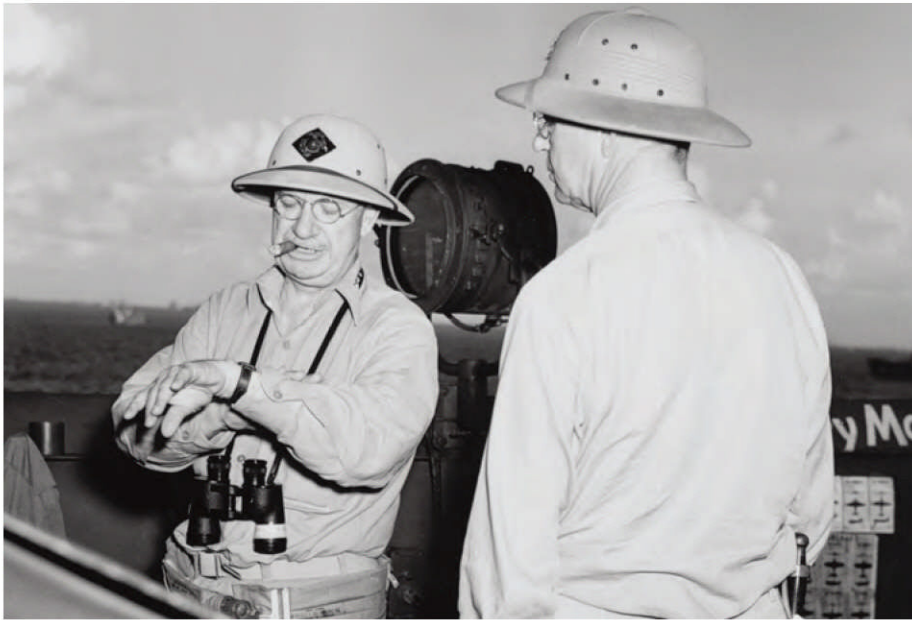
LtGen Holland M. Smith, left, aboard USS Rocky Mount (AGC-3) at H-hour on D-day off Saipan, June 15, 1944.