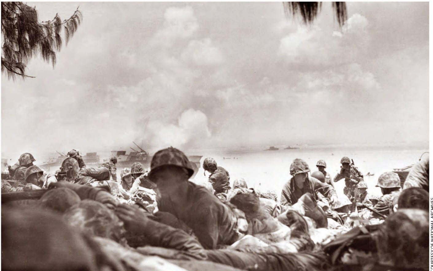
Marines from the first wave hug the beach on Saipan and prepare to move inland on D-day, June 15, 1944. Note the burning LVT in the background.