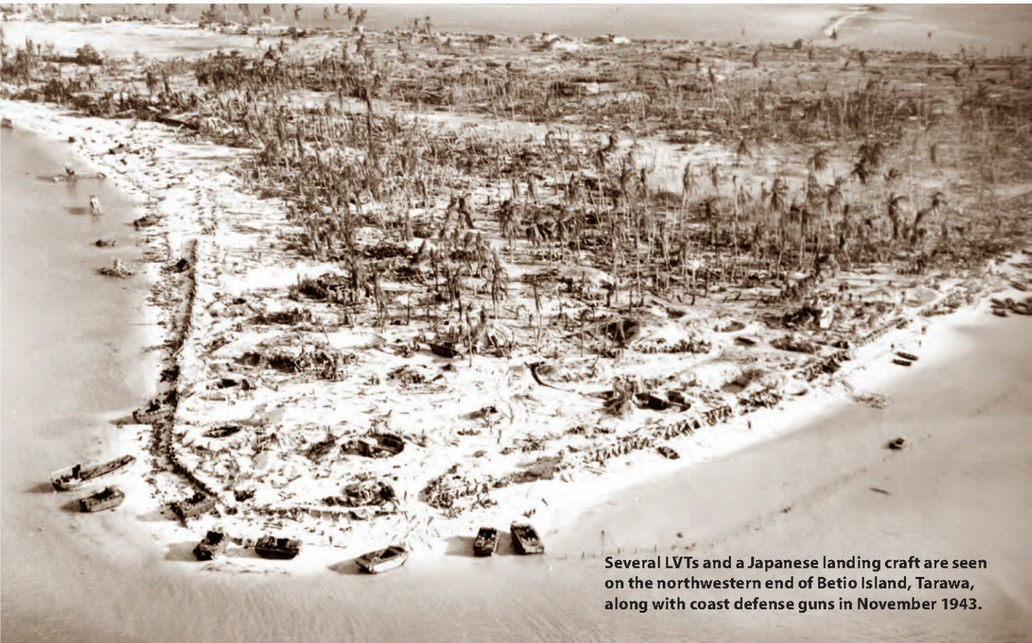
Several LVTs and a Japanese landing craft are seen on the northwestern end of Betio Island, Tarawa, along with coast defense guns in November 1943.