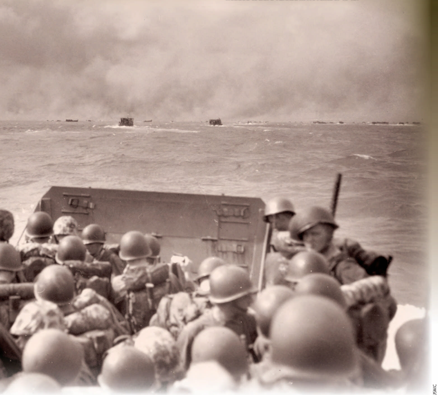
Marines crowded together in a Higgins boat headed toward Tarawa in November 1943.