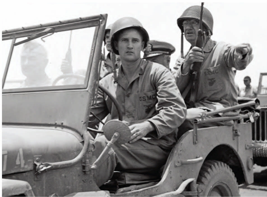
LtGen Holland M. Smith tours the area near the Saipan airport in August 1944.