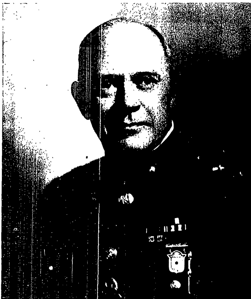
THE MAJOR GENERAL COMMANDANT, T. HOLCOMB