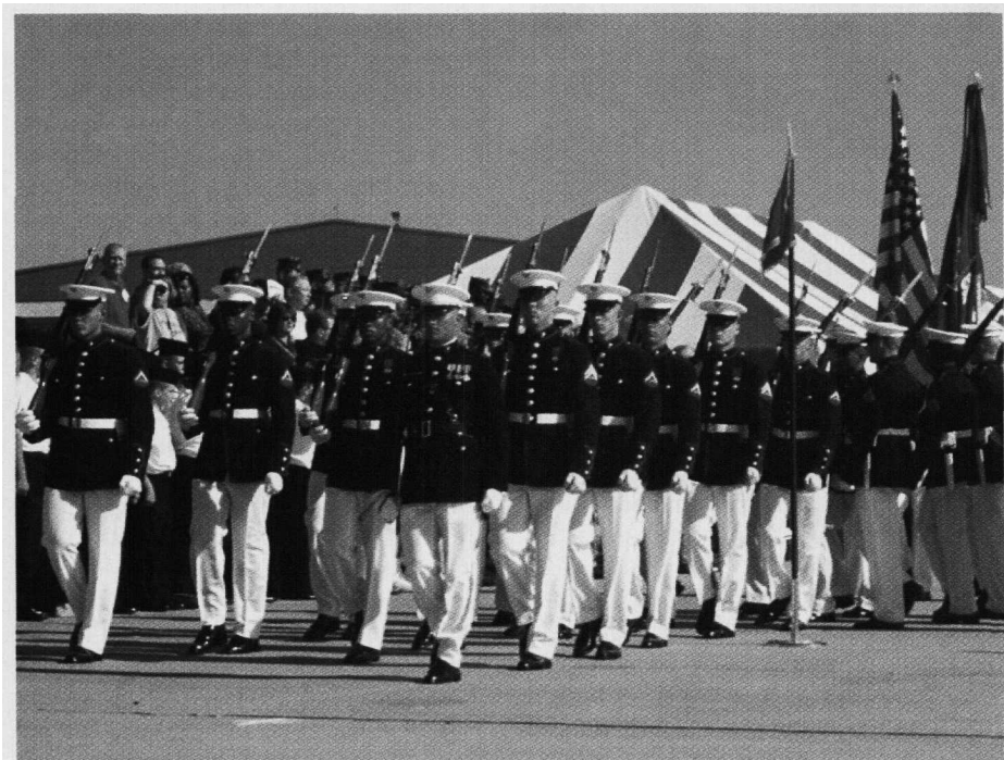
The award recipients—and their guests—reviewed a parade in their honor at MCAF, Quantico, staged by members of MB, Washington.