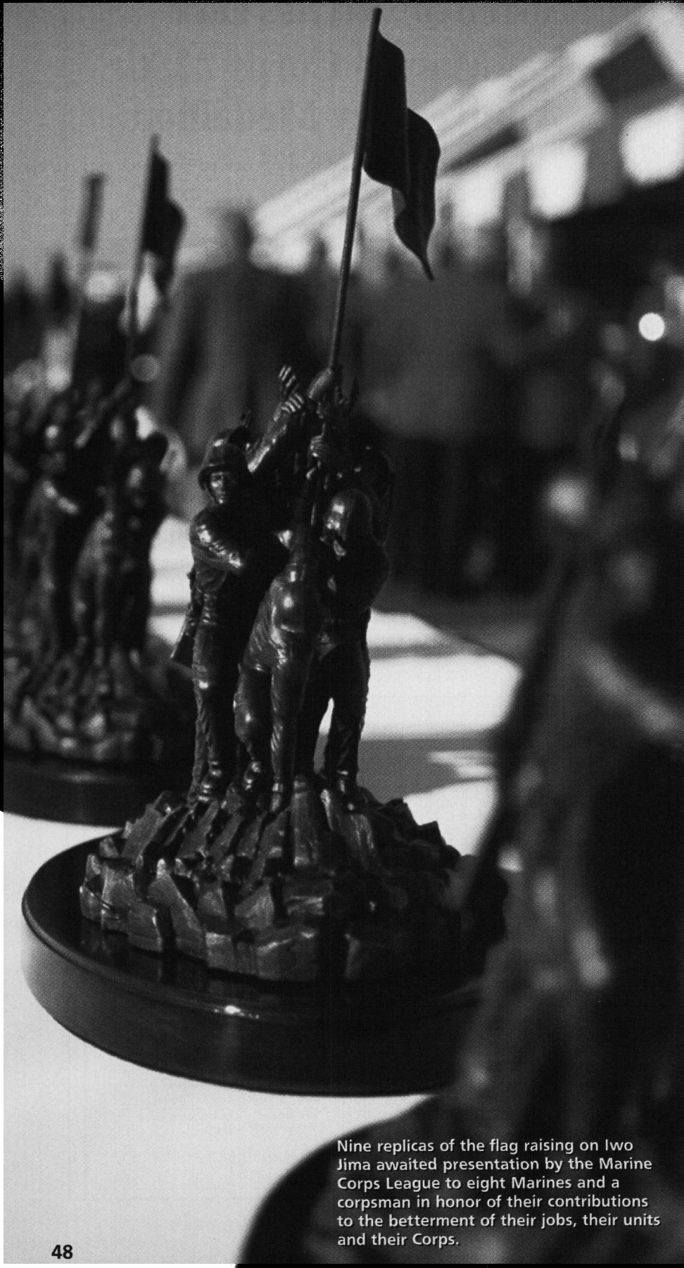
Nine replicas of the flag raising on Iwo Jima awaited presentation by the Marine Corps League to eight Marines and a corpsman in honor of their contributions to the betterment of their jobs, their units and their Corps.

I t was the 20th Modern Day Marine Military Exposition, sponsored by the Marine Corps League, and all the big guns were present—from the leading defense contractors in the nation and from overseas to the top brass of the Marine Corps from every clime and duty station.