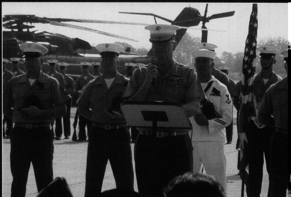
Clockwise from above: CMC, Gen James L. Jones Jr. congratulated those whose significant contributions have increased combat readiness. The 10 winners not only were recognized publicly but also were presented trophies in the form of a replica of the flag raising on Iwo Jima. As the awardees and honored guests looked on, the band passed in review, playing "The Marines' Hymn."