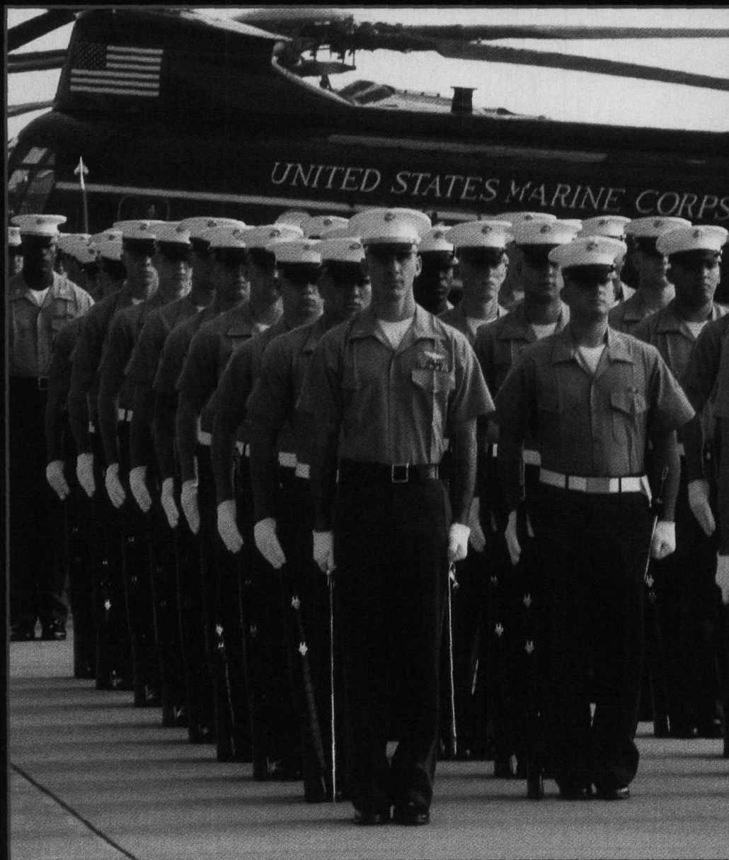
Members of MB, Washington, including the Silent Drill Platoon and Marine Corps Color Guard, fell out in summer service "Charlie" uniforms, which surprised many of the former and present military gentry who turned out to watch the traditional Marine Corps League's Enlisted Awards Parade and Presentation, hosted for the past eight years at MCAF, Quantico, Va.

When the Marine Corps League sponsors a shindig, people come. They've been holding the Modern Day Marine Military Exposition annually at Marine Corps Air Facility, Quantico, Va., for eight years since moving out of Washington, D.C., in 1994 and are still drawing throngs of military men and women as well as contractors and just plain interested folks.