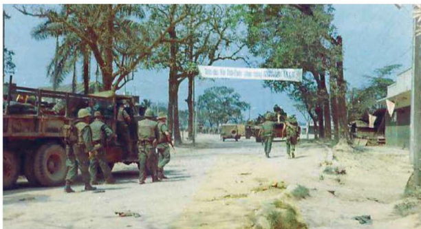
BY WILLIAM PETERSON

"We came up east of the city and came down the river at a very low altitude. It was first light over the Citadel, and our radio traffic was going berserk," Laramy