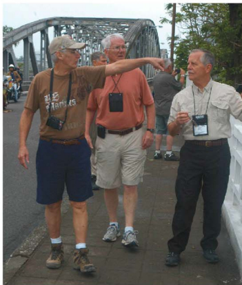
Above: The MACV compound was never taken by the NVA and flew the American flag throughout the fight. As a result, it was a rallying and staging point for Marines. It also kept communications open with commands in Phu Bai and Da Nang.