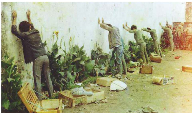
Below: On 6 Feb., Golf Co stormed the provincial prison, fighting its way in to take on the added problem of sorting Communist soldiers and sympathizers from criminals and political prisoners. The process started by lining everyone up against the walls.