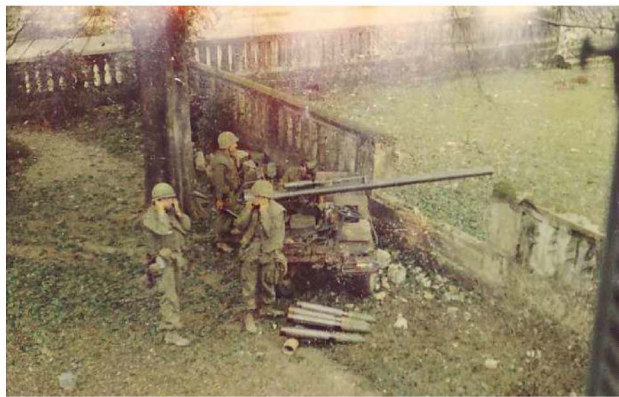
DAVID WILLIAM PETERSON

Above: A Golf Co 106 mm recoilless rifle mounted on a motorized mule prepares to send a round into enemy positions during the street fighting.