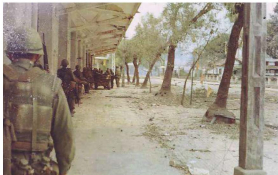
The University of Hue (above) on Le Loi Street saw Marines occupying the north side of the building as they moved to the fighting in 1968. Today, the same building (right) is the Hotel Saigon Morin, offering luxury rooms and restaurants.

Again, they relied on 106 mm recoilless rifles. According to Christmas, the Marines threw smoke grenades to cover the