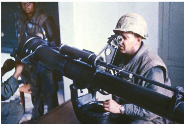
Above: Leathernecks of 5th Marines muscled a 300-pound 106 mm recoilless rifle up to the second floor of the University of Hue to get a better firing position on the treasury building just down the street. Once the weapon was sighted in, they hooked up a 20-foot string lanyard and backed out of the classroom and down the hall. The back blast collapsed the classroom and tore out the walls—the treasury building withstood the round.

That night the North Vietnamese dropped the Bach Ho Railroad Bridge into the River of Perfume, but south of Hue, the bridge on Highway 1 that crossed the Phu Cam Canal still was unscathed and the American forces were streaming troops and supplies across. Two French