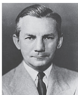
James V. Forrestal

was a swipe at the Corps by Army General Omar N. Bradley. The efforts to reduce the Marine Corps started as far back as