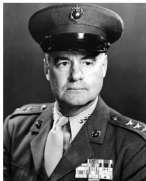
LtGen Merrill B. Twining