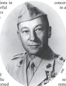
LtGen Victor H. "Brute" Krulak