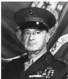
Gen Alexander A. Vandegrift, 18th CMC