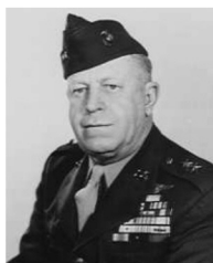
MajGen Merritt A. "Red Mike" Edson