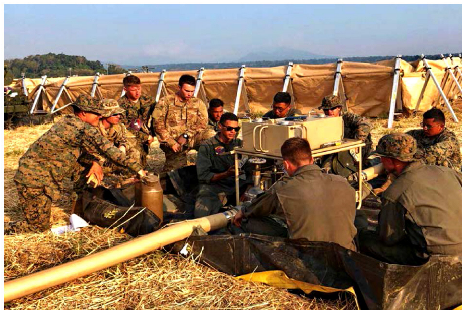
Marines and Airmen participating in a fuel additization capability operation.

Our most senior leaders in both the Navy and Marine Corps recognize the