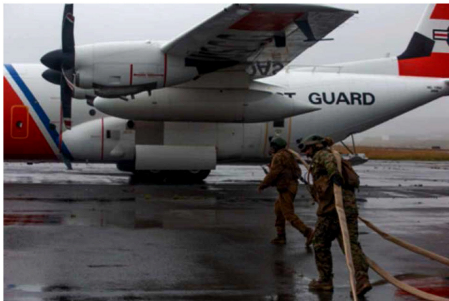
A U.S. Coast Guard C-130 participates in forward arming and refueling point operations during Arctic Expeditionary Capabilities Exercise in Adak, AK, on 18 September 2019.

unique ability to expeditiously aggregate into a refueling capability to support a combined arms endeavor from humanitarian assistance/disaster relief operations to full-scale combat operations makes the Marine Corps fuel capability the top expeditionary choice to deploy first across the range of military operations.