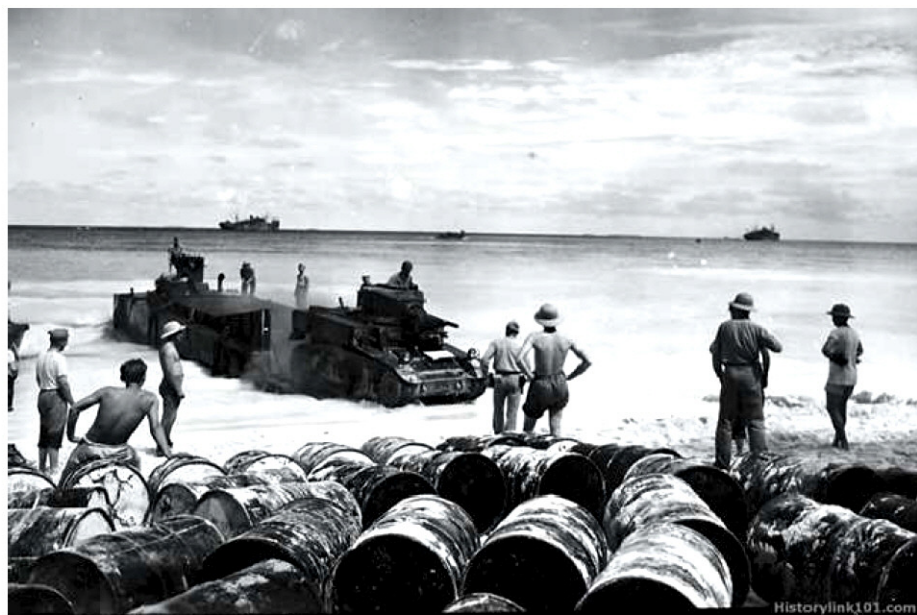
Medium tank comes ashore with a rush. Fuel in the foreground will keep tank in operation. Marines worked tirelessly to keep the atoll supplied with fuel. Samoa-October 1942.

Many witnessed or were a part of the "operational pause" echoed throughout