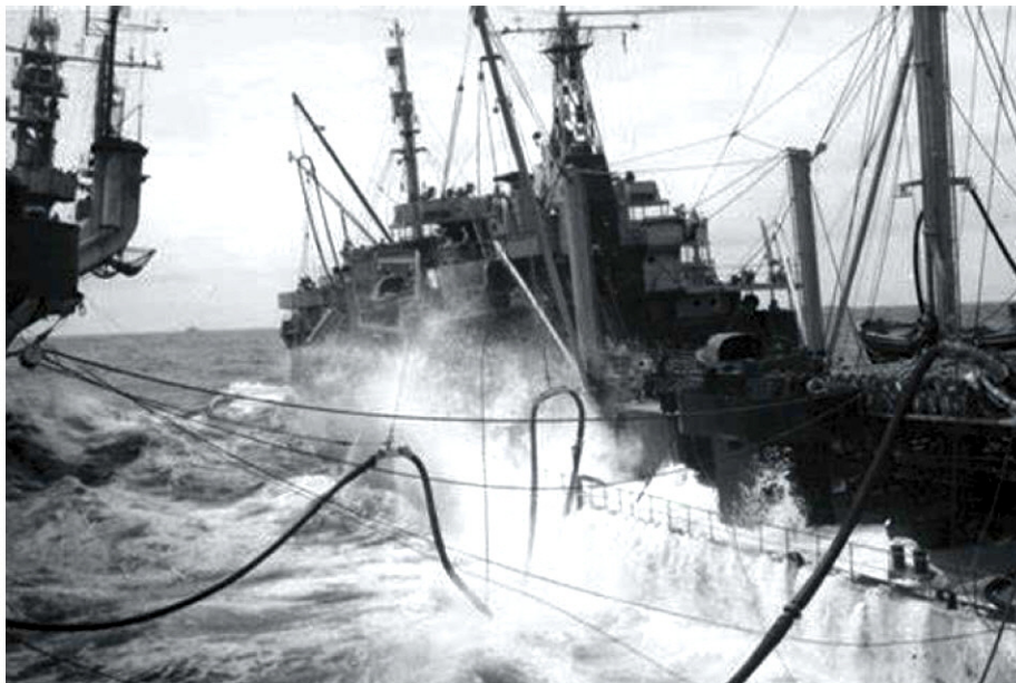
USS Kawishiwi (AO-140) fleet oiler conducting underway fuel replenishment.