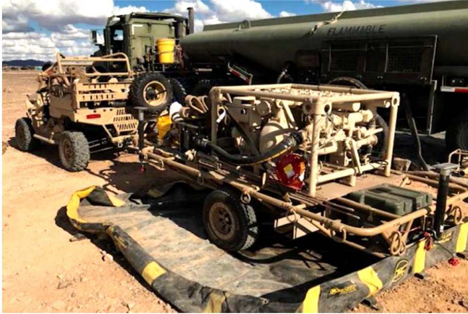
The Marine Corps tactical air ground refueling system.

dig themselves out of a hole, they just deepen it. The Navy and Marine Corps may be facing a period of active inertia where legacy bureaucratic policies and methodologies come at a cost to operational reach allowing adversaries to capitalize on our inertia and turning it into their lucrative military successes.