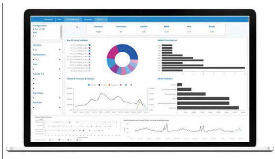
The defense-industrial base is not adequately prepared to fulfill customer requisitions in a predictable, timely, and cost-effective manner.

• Supply Chain Resiliency through Illumination: The intent is to map weapon system supply chains from