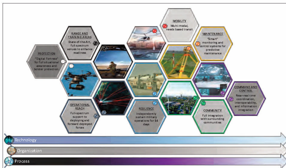
Figure 3. (Image provided by author.)

Where we previously enjoyed the shelter of the homeland, the evolving operating environment has eroded that sanctuary. Whether it be destructive acts of nature, the increasing threat from our near-peer adversaries, or the growing potential from asymmetric threats and the insider threat, our bases and stations are at greater risk of disruption or intrusion. This reality has increased our sense of urgency to harden our installations and infrastructure. Installation—neXt is looking to new and emerging technologies, organizational adaptations, and processes to create resilient installations to enable the next generation MAGTF. (See Figure 3.) With the development and completion of the IX operating concept, MCICOM will have a blueprint for the next generation installation and a roadmap to fulfill the singular goal of any Marine Corps installation—to generate and sustain combat power .