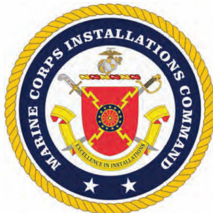
Figure 1. MCICOM logo.

Thus, Commander, Marine Corps Installations Command (COMMCICOM)/Assistant Deputy Commandant, Installations and Logistics (Facilities) (ADC, LF) has the ultimate responsibility to ensure our installations are resourced to execute their primary mission—to generate and sustain combat power .