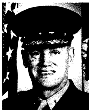
Terrence P. Murray

The President has nominated the following active duty general for promotion to major general: