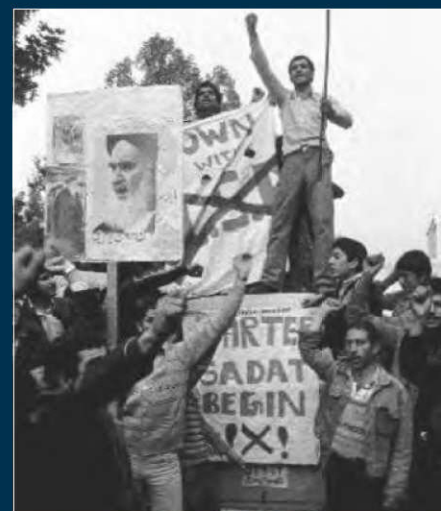
Above: Iranian students protest American involvement in Iran near the U.S. Embassy in Tehran, Iran, Nov. 6, 1979, where staffers were being held hostage after the embassy was seized two days prior.