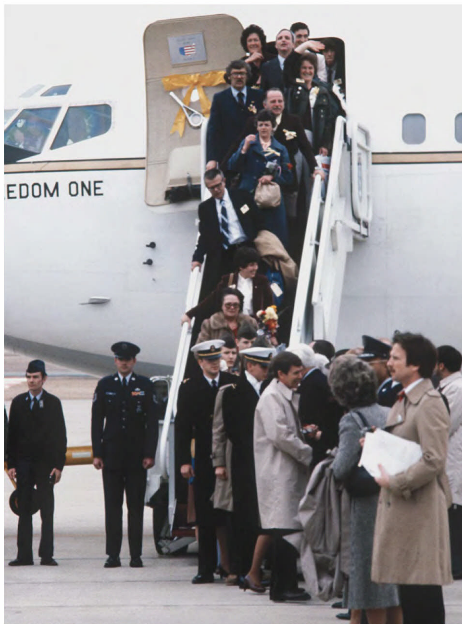
Former Iranian hostages and their families disembark upon their arrival at Andrews Air Force Base, Md., in January 1981. The hostages had been reunited with either their spouses, if married, or their parents, if unmarried, at United States Military Academy West Point in New York prior to their arrival at Andrews, where the rest of their family members waited anxiously to greet them.

zealous student protestors, dreaming of an Iran eradicated of Western influence and backed by Iran's newly empowered religious leader Ayatollah Ruhollah Khomeini, blatantly violated international law and stormed the sprawling 27-acre embassy compound.