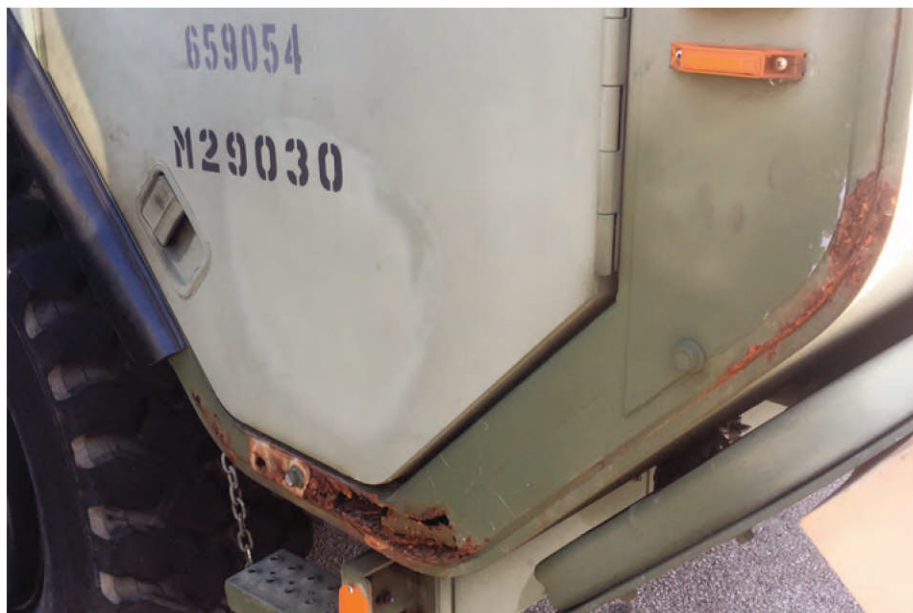
Rust and corrosion exacerbates readiness issues.

We must improve the efficiency of our supply chain. This begins at the inception of a new program. Industry