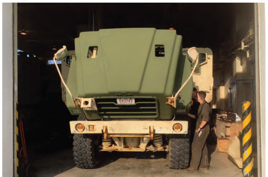
Our 3521s work hard.

Our 3521s work hard. They battle against aging equipment, the lack of fellow mechanics, and harsh environments that exacerbate readiness issues. Recent studies at 1st and 3d Marine Logistics Groups (MLGs) demonstrated that with all of the external requirements (annual training, briefs, fleet augmentation programs, etc.), the Marine Corps has approximately 40 percent of their available mechanics actually servicing