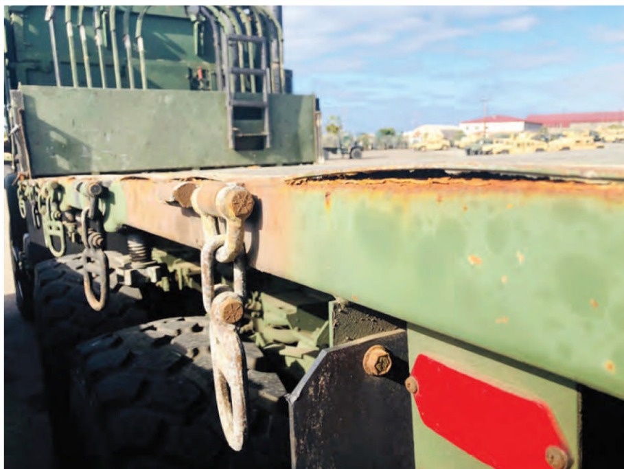
The simplest of parts, if not available locally, are at least two to three weeks from shipment.

“The Pentagon’s broken sustainment model translates into fewer platforms and systems available either to be deployed to war zones or at home stations on which Service members can train. This, in turn, means reduced proficiency for individuals and units, including maintainers. The overall effect is a readiness crisis.” 4