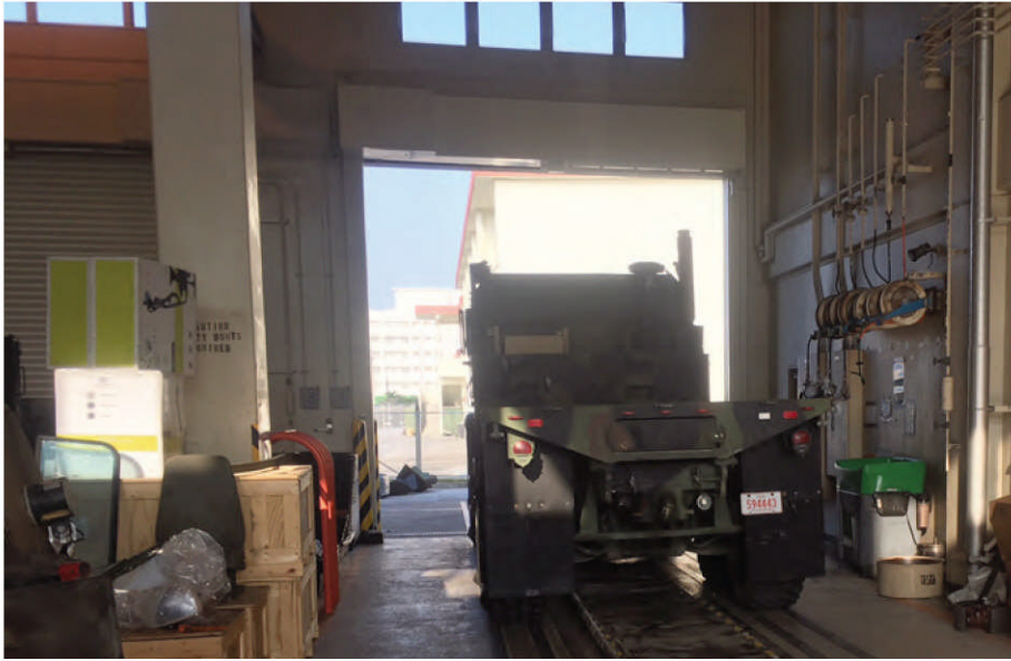
Commanders should not have to expend valuable resources just to bring a vehicle up to a certain condition to be eligible for WIR.