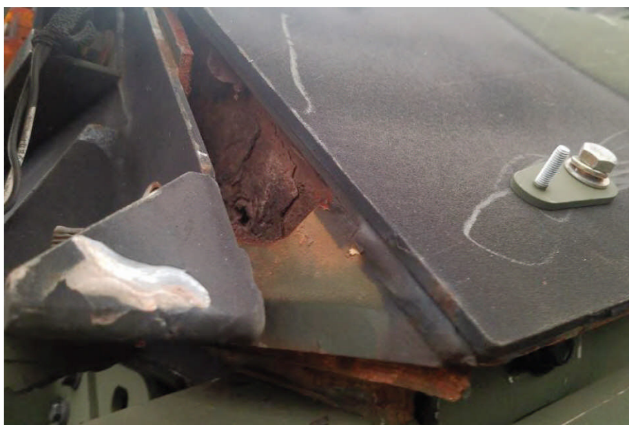
There is a reason why car enthusiasts refer to rust as cancer.