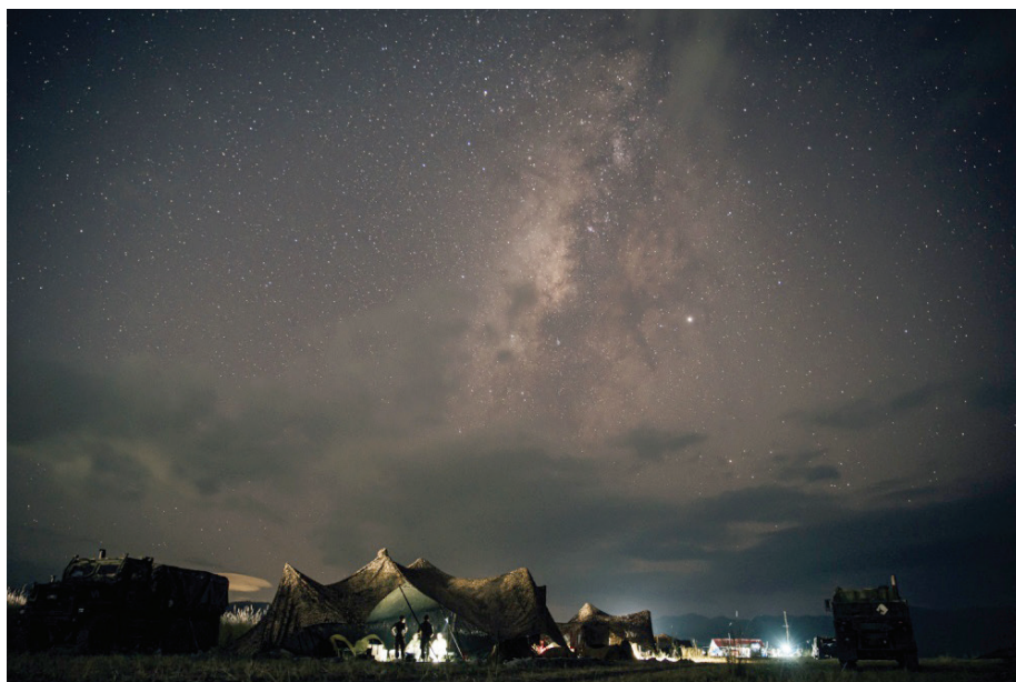
Marines with Alpha Battery, Battalion Landing Team 3/5, 11th MEU, bivouac at Colonel Ernesto Ravina Air Base, Philippines, during Exercise KAMANDAG 3, 16 October 2019.

In modern warfare, space-based support is critical to tactical success. It enables us to detect the enemy first, understand them first, take action first, and permits quick and decisive targeting to finish them. It provides redundancy in communications, ISR, and early warning in support of force protection. If we were to only rely on organic Marine Corps assets (the Marine Corps does not own any satellites), we would be allowing an enemy with space support capability to quickly out-pace our decision-making cycle, giving them a position from which to plan and execute against us first. So far, we have not allowed for that to happen. We depend on space support in several ways.