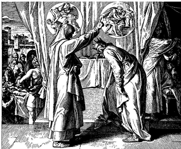
Nathan admonishes King David.

herd who courageously protected his sheep from predators and was a skilled musician who could soothe the souls of others. When David was a young teen, he defeated, with God's help, the giant Goliath. Subsequently, David was called into the service of King Saul who became ruthlessly jealous of David, especially after the King's son, Jonathan, befriended David and abdicated the kingship to David.